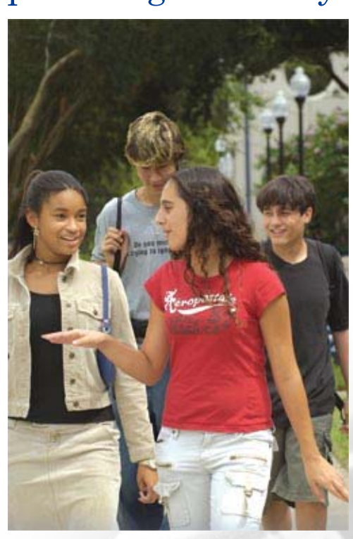
For more information go to www.spcollege.edu